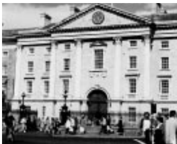
Trinity College, Dublin

Abstracts for both oral and poster presentations are invited. Closing date for submission is 15th July 2004. Abstracts should be submitted from the conference website at: www.imb.ie under 'Pharmacovigilance Events'.