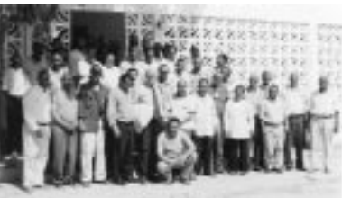
Participants of Establishment of Pharmacovigilance in Eritrea, 22-25 October 2003, Massawa, Eritrea